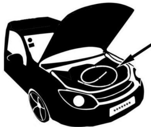
Method ② (Install on the engine)