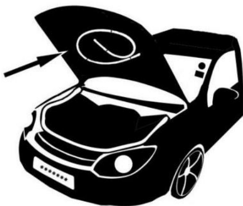
Method ① (Install on the hood)