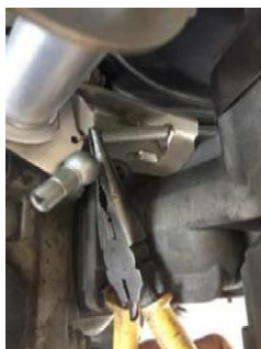
Install the Return Spring