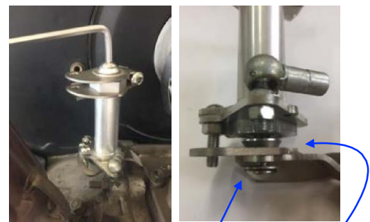
Install Center Rotor. * Note the spacer in between the base plate and rotor.