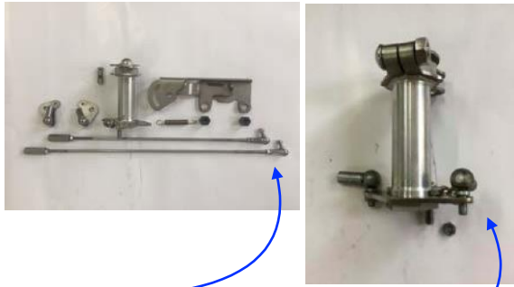
Remove the two Rods from Push Rods and attach onto the center rotor.