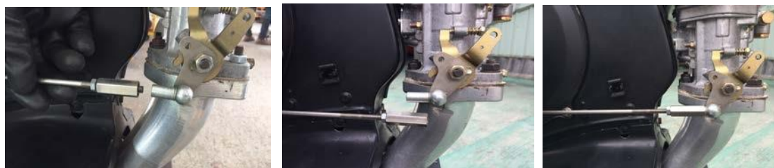
Install the two Push Rods, cut the push rod length if needed. The longer rod is for inner (#1,#2 right side carb).