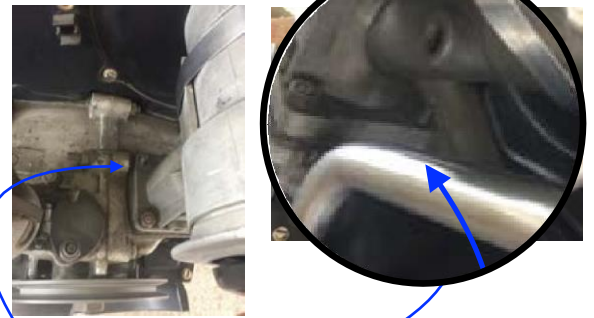
Remove the 2 bolts at inner side of alternator stand.